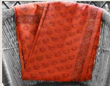
DUPATTAS 96" x 30" Floral & paisley design Block painted, hand painted & zari hand work Kora silk & chanderi Colour & design options available ` 1250 onwards