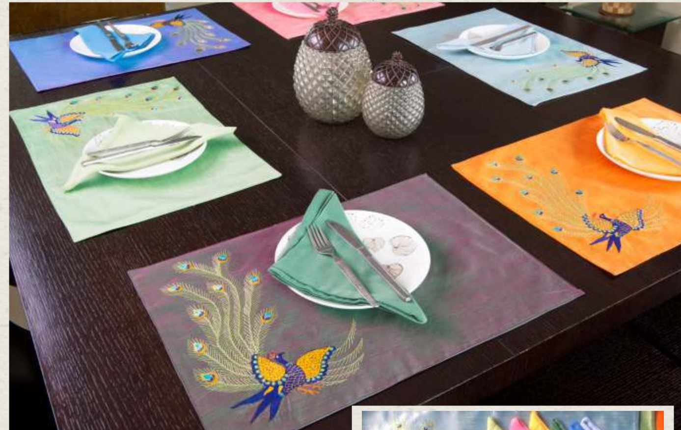
TABLE LINEN SET