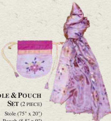
STOLE & POUCH SET (2 PIECE) Stole (75" x 20") Pouch (8.5" x 9") Pure silk Hand painted ` 1500