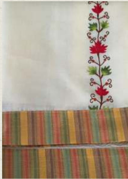
STOLES (EMBROIDERED) 75" x 20" Hand embroidery Pure silk with border ` 1500