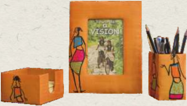
Photo frame (7" x 9") Card holder (2.5" x 4" x 4") Pen holder (4" x 2.5" x 5") Jazzy girl design Resham embroidery on dupion silk Colour and design options available ` 750

14" x 11" Resham brocade and cotton fabric Cotton lining ` 250 onwards